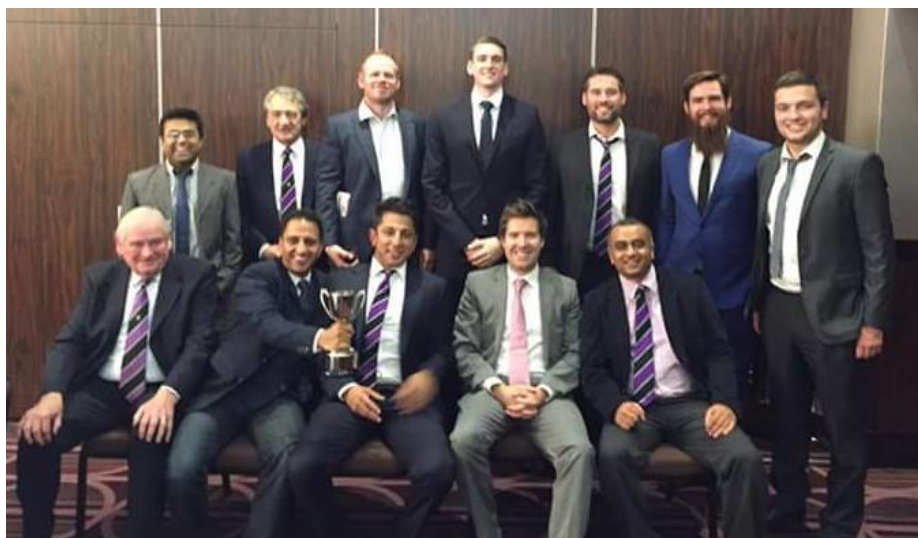
Southgate contingent at the Middlesex County Cricket League Dinner, 21st October 2016

92 players took part; 15,551 runs were scored (including 1,536 extras); 335 catches were taken and 18 stumpings. 20 catches were unidentified in the scorebooks this year.