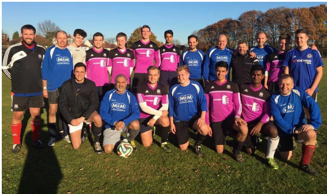
The year ended with the Christmas social football match between the Under 30s and over 30s which the Over 30s won 4-1.