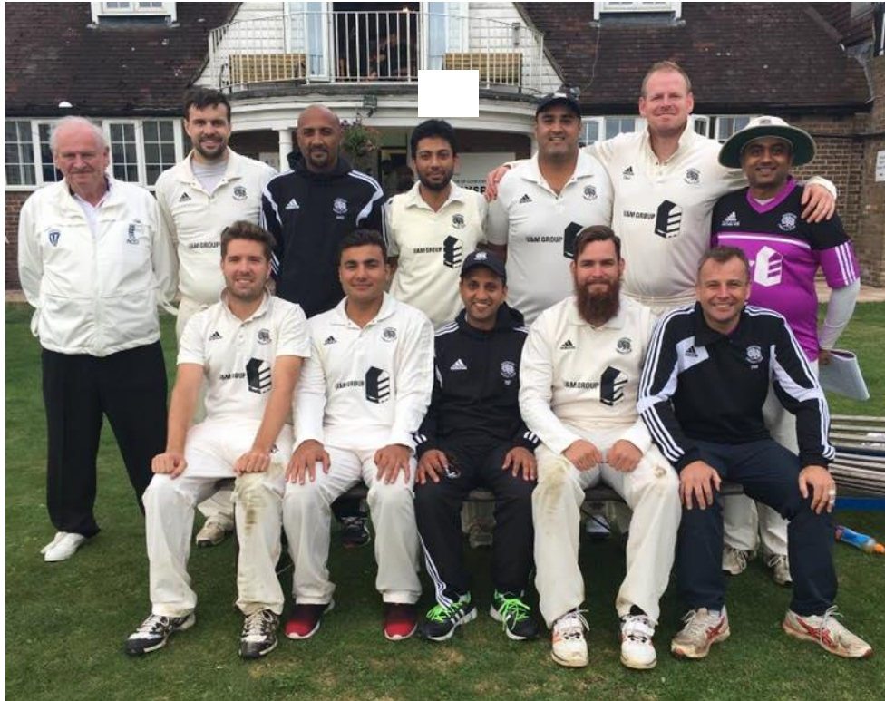
Southgate 2 nd XI vs Harrow St Mary's, 20th August 2016