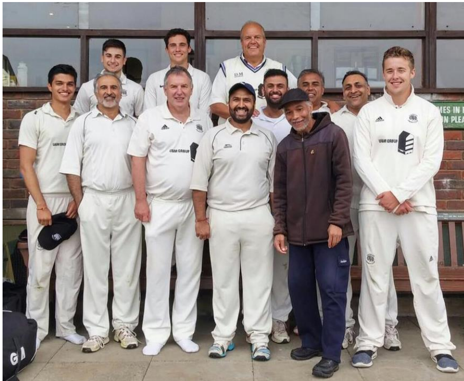
4 th XI v Harrow Town, 3 rd September 2016