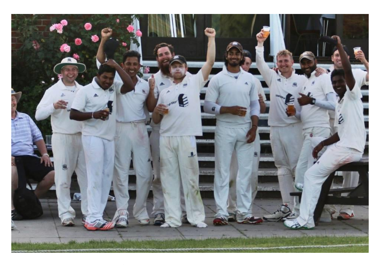
Southgate 1st XI celebrate their first win over Ealing since 1998