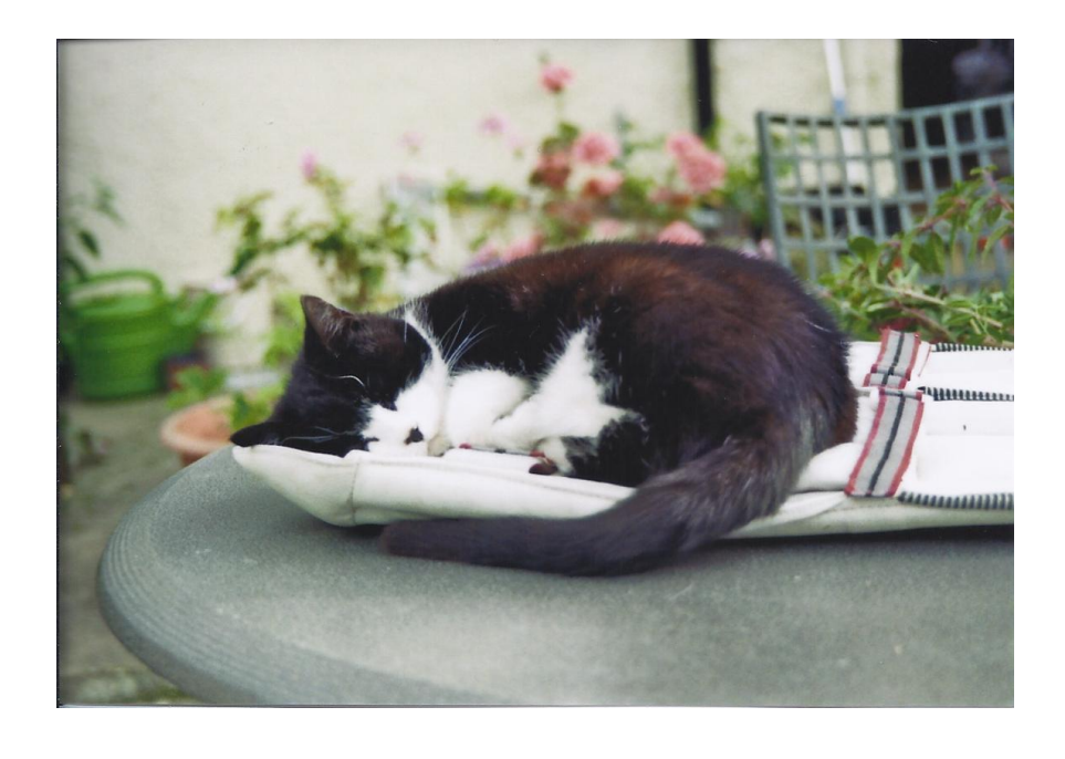
Wicketkeeping pads airing in the garden