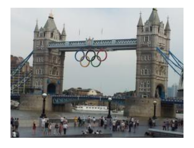
London Olympic Games