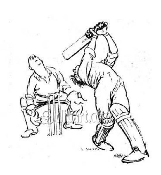
Ben Chambers sets the 3<sup>rd</sup> XI innings alight at North Middlesex