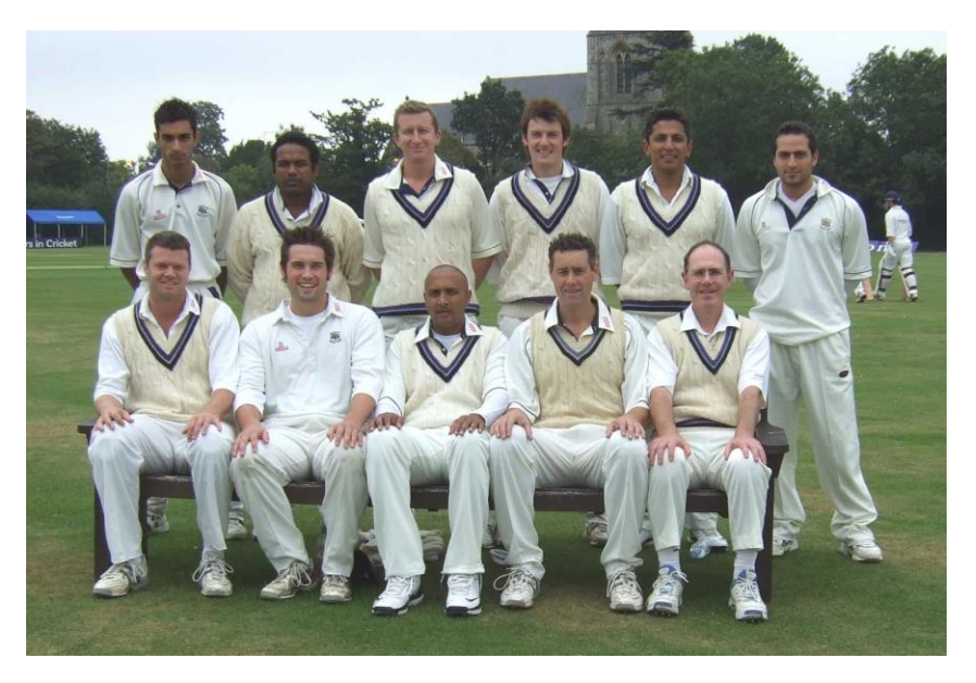
Southgate 1st XI 2007